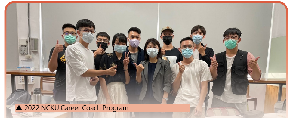
▲ 2022 NCKU Career Coach Program

As the complexity of technology research and development increases, the high-tech industry is now gradually moving toward supply chain integration or cross-industry cooperation. More emphasis will be placed on interdisciplinary competence. Therefore, in response to the "National Key Fields Industry-University Cooperation and Skilled Personnel Training", Taiflex and six other companies have jointly funded the establishment of the "College of Semiconductor & Advanced Technology Research" of National Sun Yat-sen University. In 2022, the course quota of 120 students for the first class was already met. The program will nurture thousands of high-tech quality people within ten years, injecting new forces to the next-generation technology industry of Taiwan and cultivating top talents with global competitiveness. We provide two lecturers at present and expect to train 40 young talents.