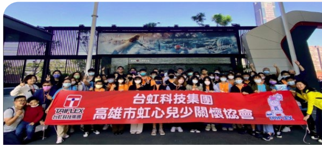
▲ Kaohsiung study tours ▲