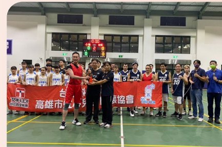
▲ Sponsored sports jersey for basketball team of Siao Gang Senior High School ▲